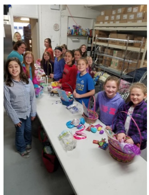
Girl Scout Troop 597 Supplies and help with the Easter Basket project (68 baskets were given out).