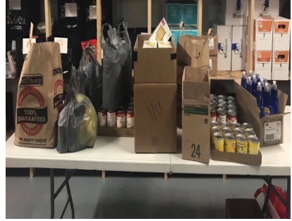
New Hope Baptist Church Filling our "out of stocks".