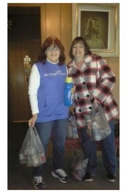
First United Methodist Souper Bowl Collection