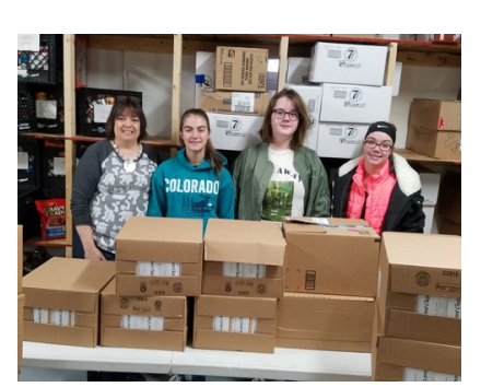
Girl Scout Troop 33 Instant Oatmeal and $400