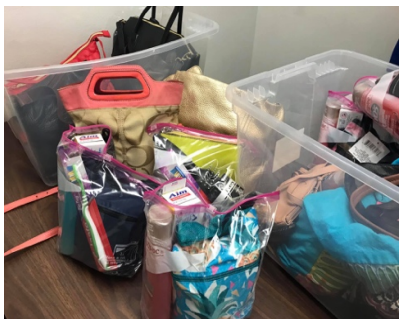
Noah Atkins-Harris Special hygiene kits