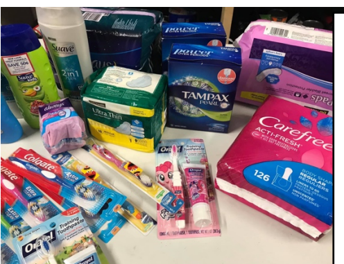
Net Community Church Monthly Hygiene Donations