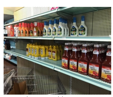
The Assembly $200 monthly toward condiments