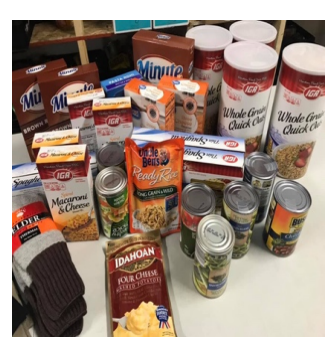
Powder Puff and Pinewood Derby donations